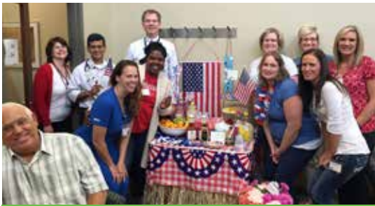
Illinois CancerCare team at Bloomington/Normal Clinic celebrates National Survivors Day