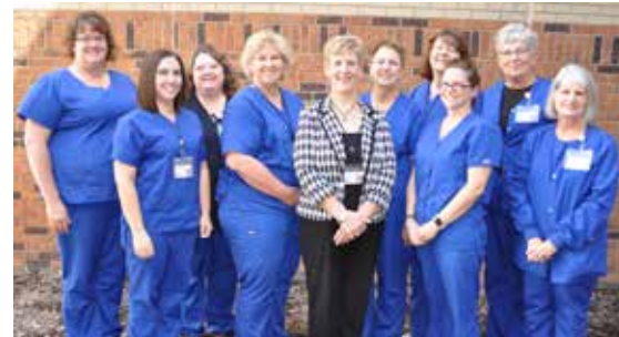
Charge Editor Team