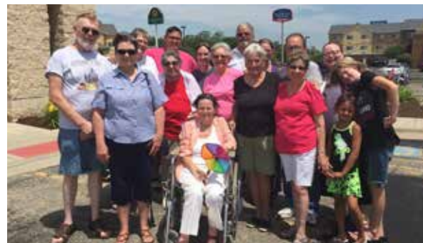
Patients of the Peru Clinic gather to celebrate the 5 year anniversary