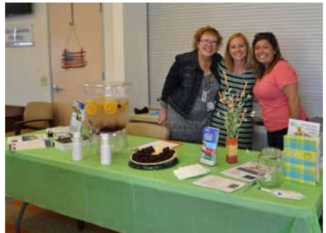
Hult Center for Healthy Living Staff share nutrition tips and patient resources